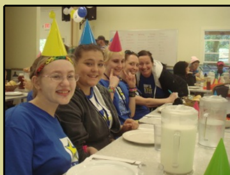
A couple of our more senior campers, getting ready to celebrate one of Camp Starlight's milestones. "Sing a song, Camp Starlight. Sing a song!"

The heart of Camp always has been and continues to be the connection between the volunteers and the kids and the magic that this kind of community creates. Those who volunteer at Camp Starlight find